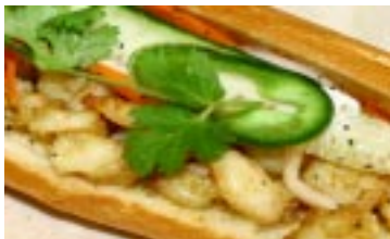
Cajun shrimp $3.25 / 8" $4.25 / 12"